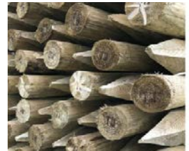
Fencing Stake peeled UC4