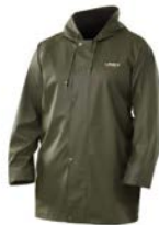
Line7 Station Jacket